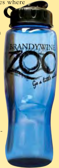
Get your reusable water bottle at our Zootique.

Balloons can travel hundreds of miles, before popping or just landing in any area, endangering wildlife and polluting the environment. So hold off on getting a straw with your next drink and consider the risk to wildlife and our environment.