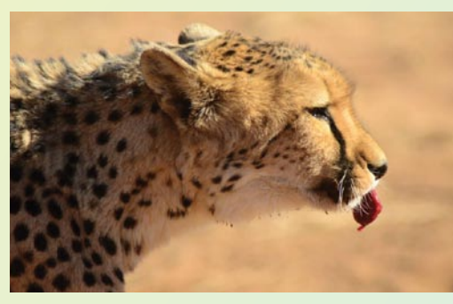
One of CCF's ambassador cheetahs eating a treat during an enrichment session

tested in 'real life' by releasing them into a large (50,000 acres+) fenced camp rich with species like giraffe, zebra, kudu, steenbok, eland and warthog. CCF employees monitor soft-released cheetahs to insure they are able to find food and water, but will supplement them, in the mean time, with meat and water daily. This is where my