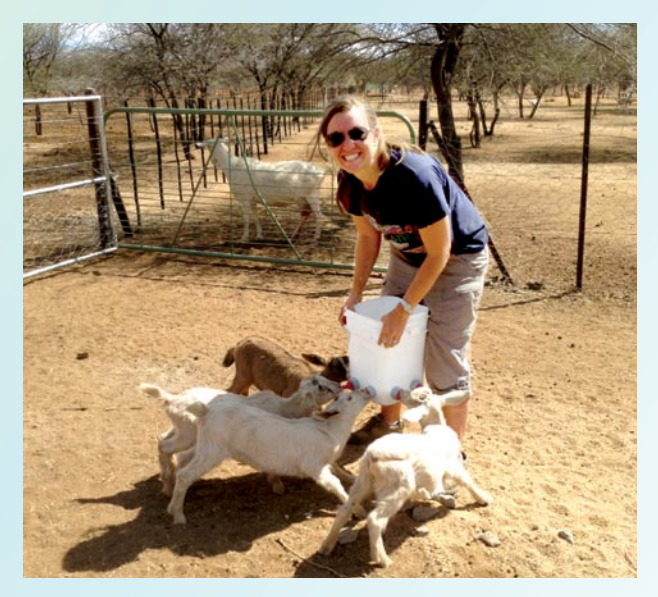
Feeding kids in the kraal

close encouter with carnivores at Etosha National Park in Northern Namibia. For now, I'll just say that when you feel like prey, you most likely are!