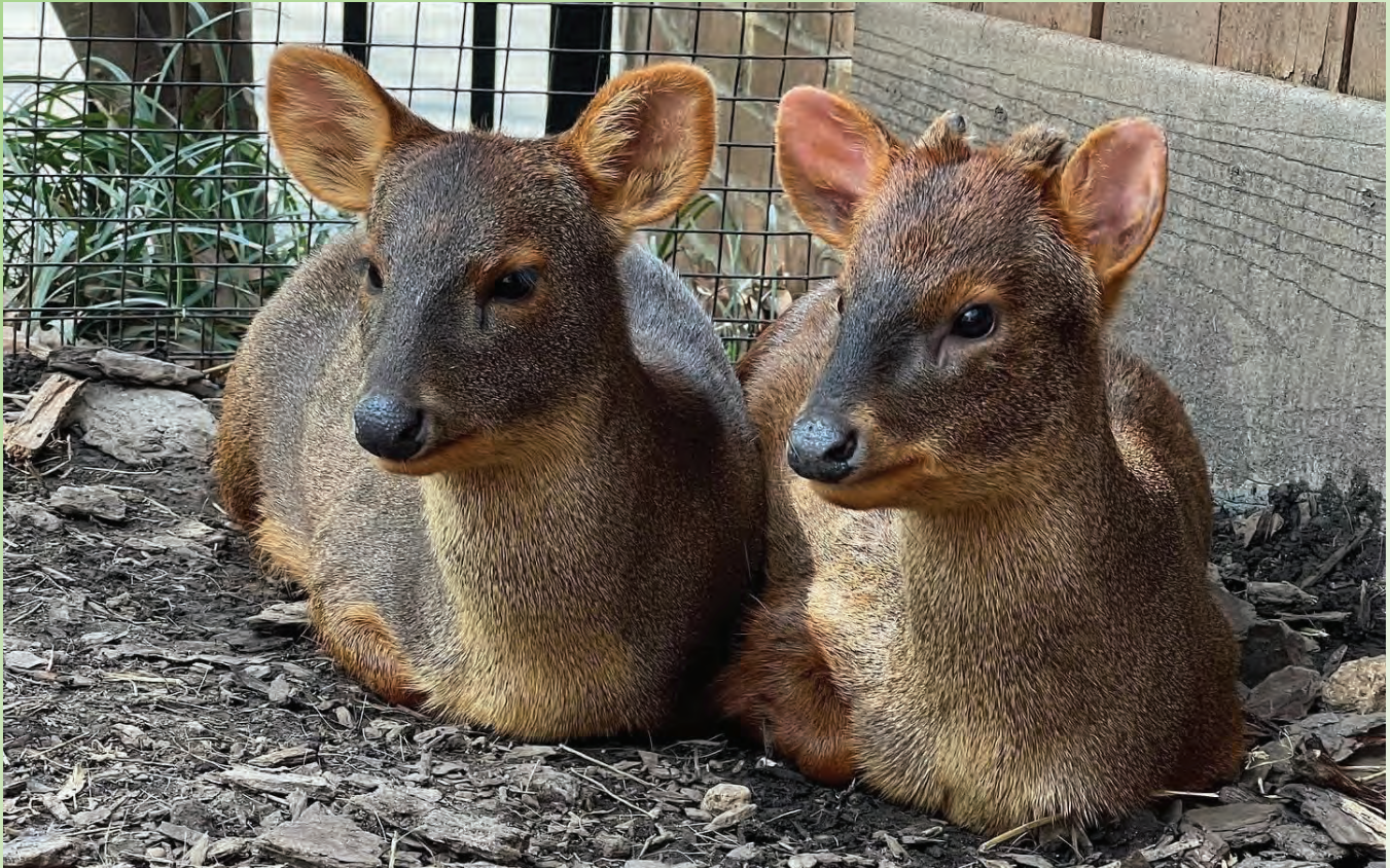
Southern pudu, Clover and Ande have bonded and it is hoped they produce offspring.

Zoos accredited by the Association of Zoos & Aquariums (AZA), such as the Brandywine Zoo, are focused on maintaining a healthy population of pudu in zoos by utilizing the Species Protection Program (SSP). The SSP pairs genetically optimal animals, in hopes for offspring to add to the population. Both Ande and Clover were born in AZA zoos in the United States. The SSP program recommended the pairing and assigned them to both to the Brandywine Zoo.