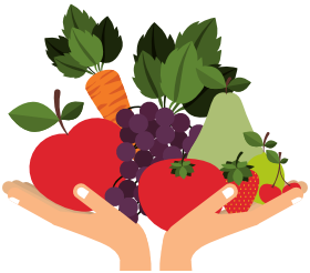
animals that eat plants