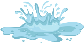
animal water source