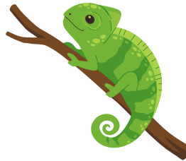
an animal climbing