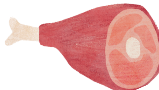
animals that eat meat