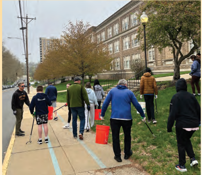
Participants scout 18th Street for trash

Our next cleanup will be held on July 12th at 9am. If you would like to join us, RSVP by emailing communityengagement@brandywinezoo.org or calling the Education office at 302-407-4406. It's helpful to have a headcount so we can prepare supplies accordingly. July may have additional activities along these lines too, so keep your eyes and ears out for more!