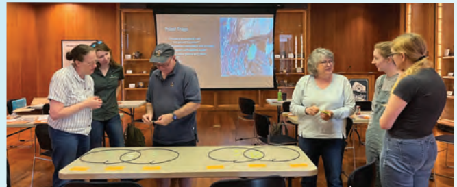
Participants engage in a moth/butterfly activity

those caterpillars is valuable data for scientists and policy makers. For example, over 30 papers have been published using MLMP data. If you would like to conduct your own observations, please visit www.mlmp.org . Citizen science has proven valuable for a vast array of projects around the world. We look forward to continuing our project participation and teaching others to do the same!