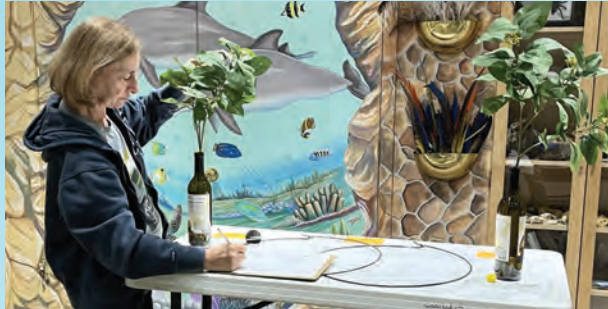
Participant searches for life stages on fake milkweed.

Monarch butterflies were sighted in Delaware and surrounding states in late April as they make their northern migration from Mexico. Learning where they go, which species of milkweed they prefer to lay their eggs on, and the success or failure of