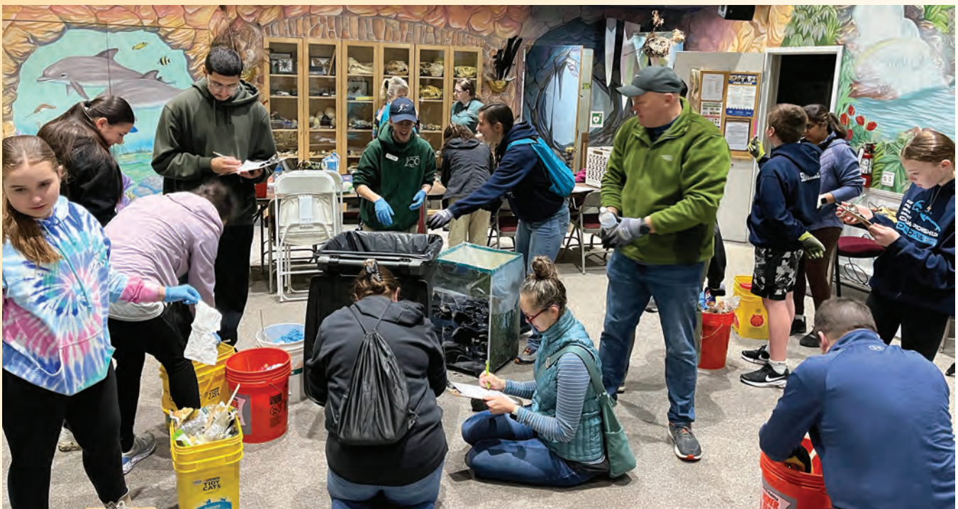
Participants tally items they collected during litter cleanup